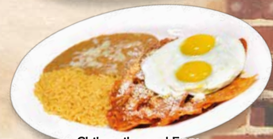
Chilaquiles and Eggs