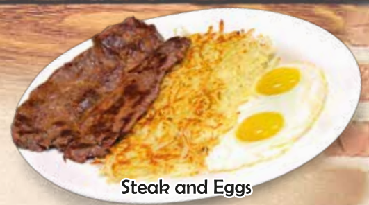
Steak and Eggs