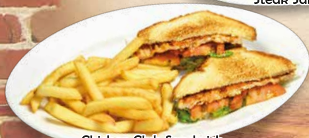
Chicken Club Sandwich