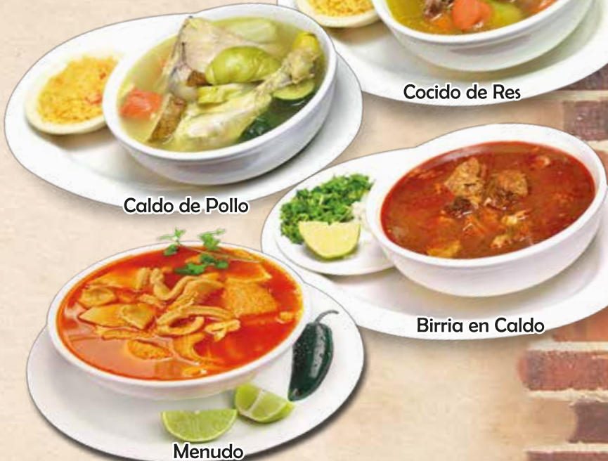
Cocido de Res