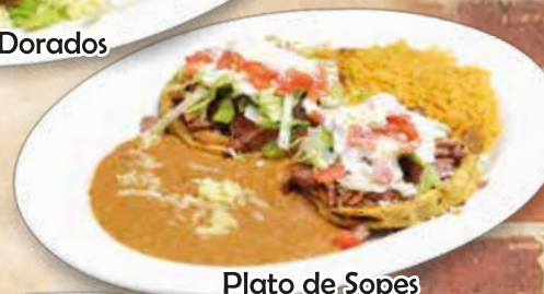
Plato de Sopes