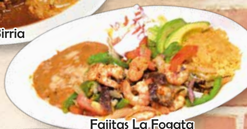
Fajitas La Fogata