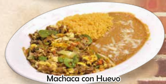
Machaca con Huevo