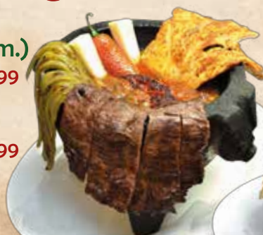
Molcajete de Carne