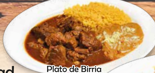
Plato de Birria