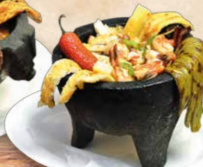
Molcajete de Mariscos