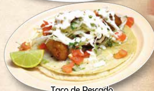
Taco de Pescado