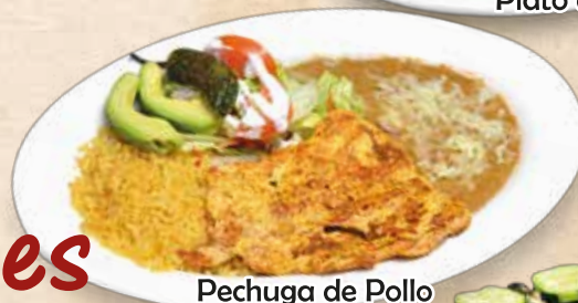
Pechuga de Pollo