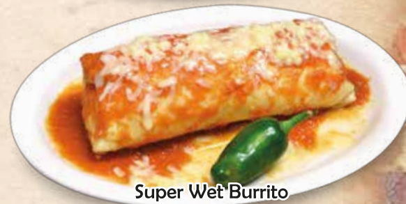
Super Wet Burrito